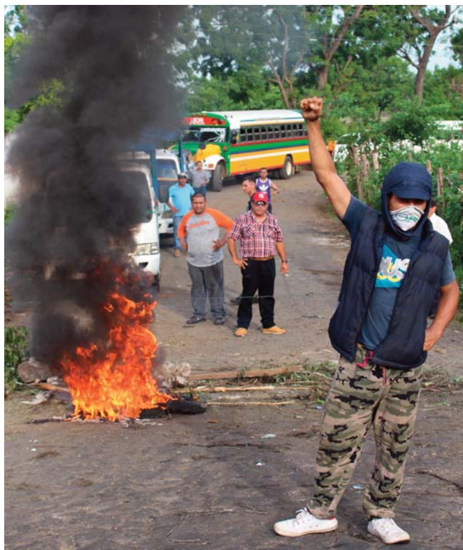
Burning tyres and undergrowth were used for barricades in Leon at the start of the uprising

In June & July, in Leon where I lived, our street was blockaded by walls made of paving stones at each end. Barricades like these were built by local people to try to protect themselves from drive-by police, shooting