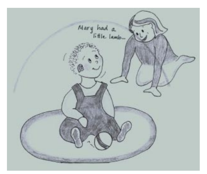
Determine the child's listening range

aware of other sensory input such as visual (movements/motion) or tactile (vibrations/feeling). When you are doing the listening activities you need to be <u>sure</u> that you are behind the child so that your baby cannot see you. Be sure your shadow is not visible or your breath or other vibrations are not felt by the child, causing a reaction, rather than the response being a specific auditory response. Doing the listening activities within six inches to three feet of your child will be the trickiest! Try to be consistent about how loud you make the noises as you present them at different distances. Your opinion based on watching your child respond to sound is important!